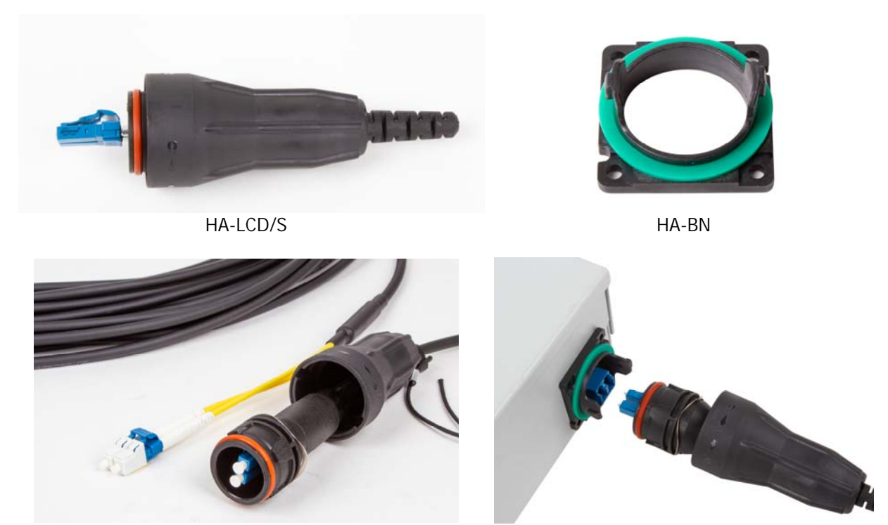
HA-LCD – example of application

HA-BN panel mount adaptor protection frame (appropriate adaptors ordered separatelly)