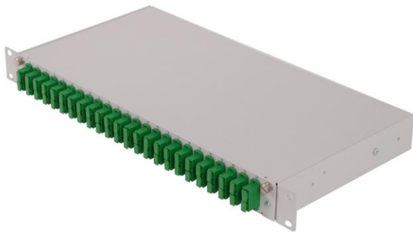
TMVJ-1U with FT-24-DSC Base unit with patch panel for 24x DSC adapters

The TMVJ Fixed Cabinet introduces a compact, low cost solution for fiber optic cable termination. The TMVJ series is ideal for rack-mounting in confined areas such as equipment enclosures where rack space is limited. The cabinet is equipped with slide-out shelf with splice tray holder. This allows easy access to the splicing area for optical network reconfiguration during operation and prevents damage to fibers prior to routing into adapters. The modular system allows splicing and termination up to 96 fibers in rack height 1U.