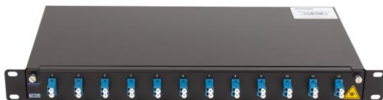
TMVJ-1B-24-DLC S-C-2 front view