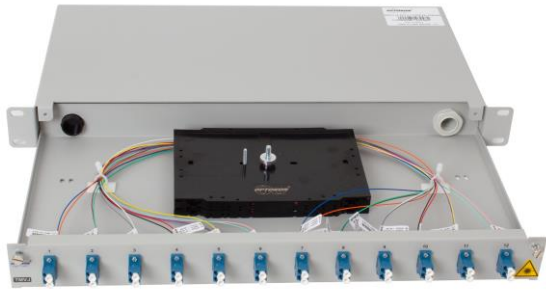
TMVJ-1-24-DLCF S-C-2/PGR RAL 7038 Internal layout – DLC/PC patch panel and 2 splice cassettes