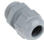
Plastic cable gland PG 13.5