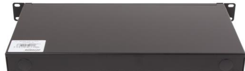
TMVJ-1B-24-DLC S-C-2 rear view