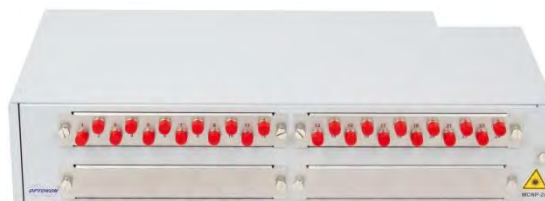
Closed MCNP-2L-24-FC-S-C-2 /A