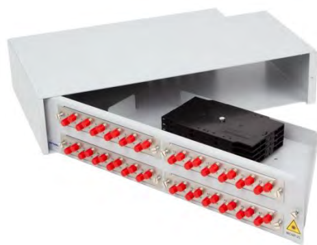
Opened MCNP-2L-48-FC-S-C-4 /A

The MCNP-L Connector network panel is an economical rack mountable ODF – optical distribution frame for use with splicing of manufactured pigtails, pre terminated cables and field-installable connectors. Made of lightweight and resistant aluminum alloy the MCNP-L offers user friendly handling during installation and operation and low transportation costs. The incoming cables are strain-relieved at the rear panel of the unit. The pivoting shelf can be equipped with either a splice tray holder or bend radius protection which guides, stores and organizes excess slack. This prevents damage to fibers prior to routing into couplings. The MCNP-L is used in installations where space is limited.